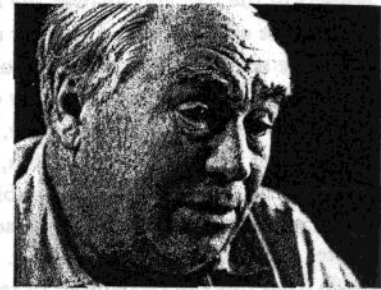
Mikhail Gerasimov 1907–1970

Reconstruction starts with depth indicators—typically small pegs. Fixed